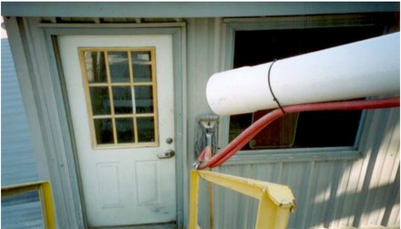
Fiber addition point located near product storage area.

It is desirable to have the starting or fiber-addition point as close as possible to the area where the fibers are stored. In some cases, this may be near the fiber-inventory storage shed, or even an open ground-level area where fiber cartons or pallets can be moved to, and covered or protected from the weather.