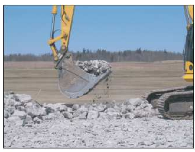
Excavator removing broken jointed reinforced concrete