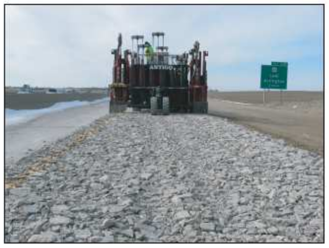
MHB breaking continuously reinforced concrete to allow for rebar removal