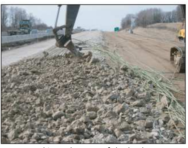
Excavator raking rebar out of the broken concrete