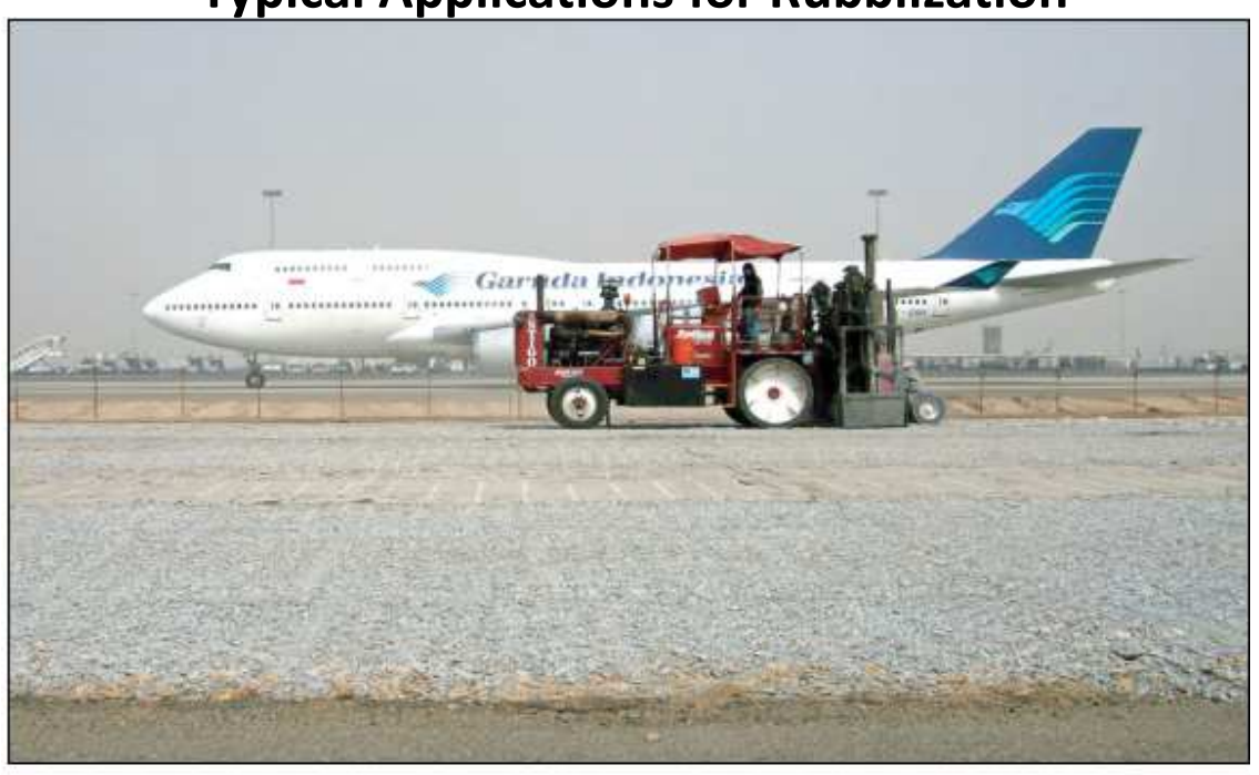
MHB Badger Breaker® rubblizing an airport runway