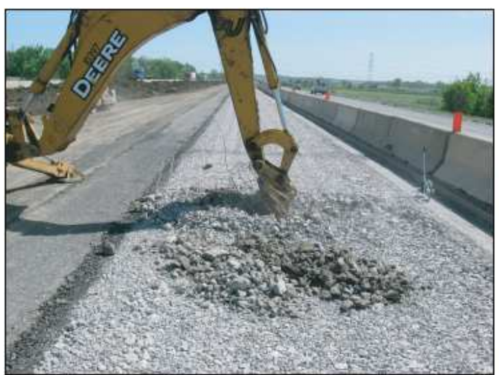
Jointed reinforced concrete pavement