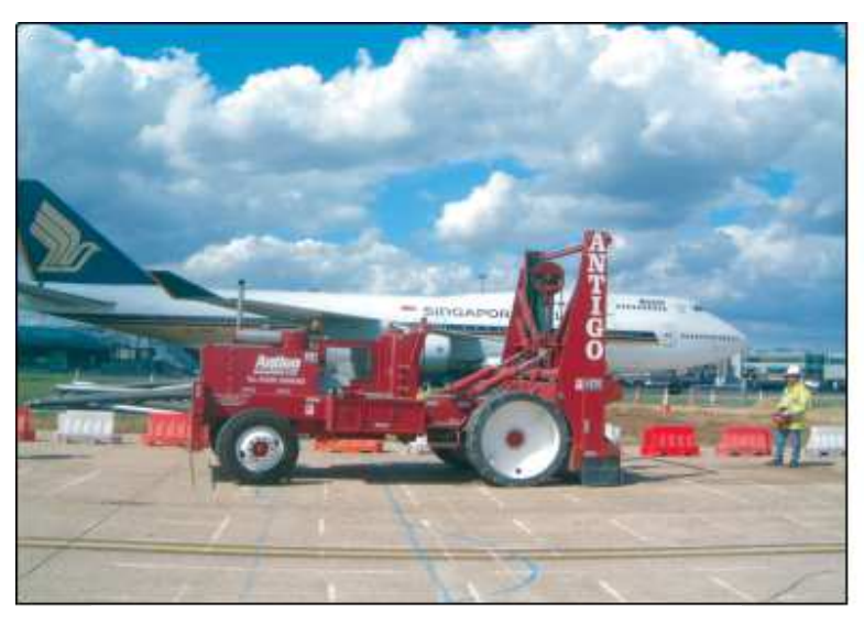
Typical airport cracking operation using an 8600 Badger Breaker®