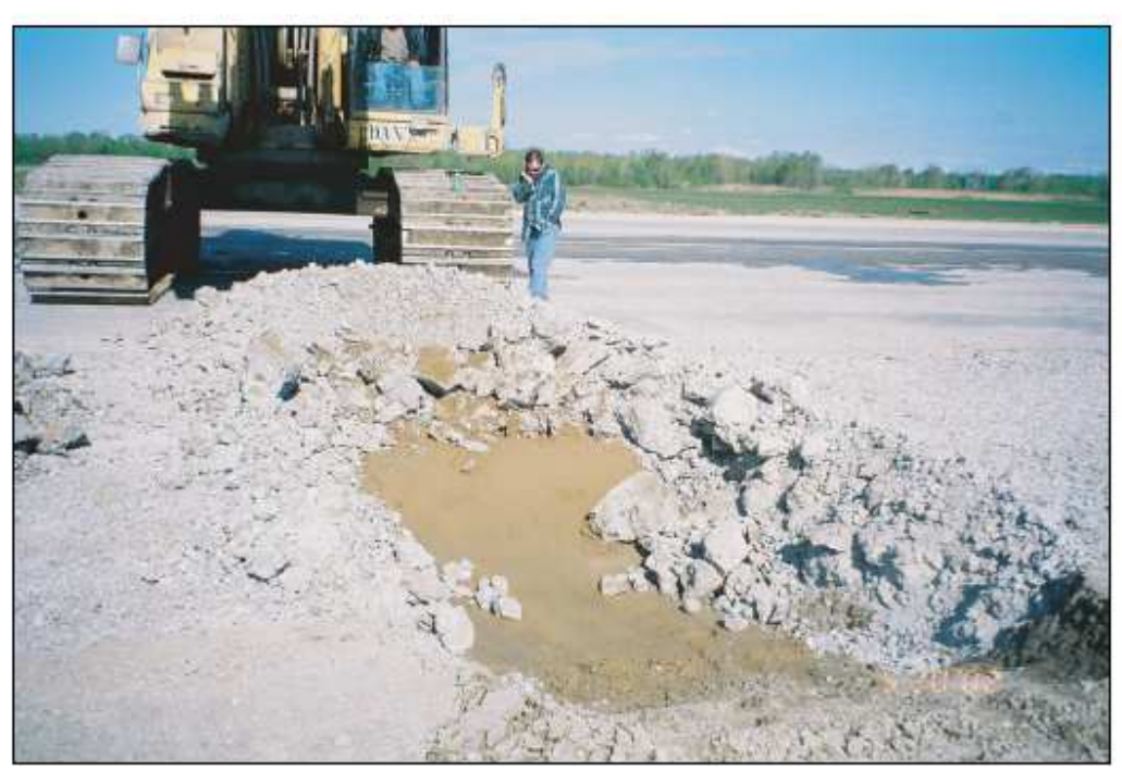
Non-reinforced concrete pavement, 21-inch (530mm) thick airport runway