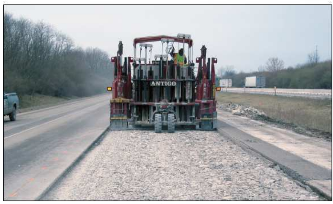
MHB Badger Breaker® rubblizing a motorway