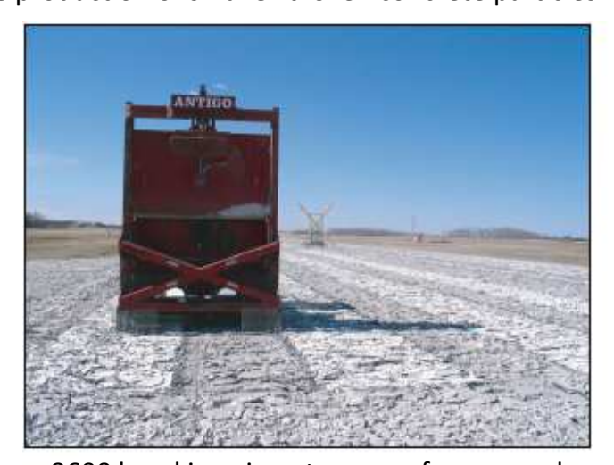
8600 breaking airport runway for removal

The 8600 and MHB are also used in tandem when the thickness and strength of existing concrete and base layers require the "hard hit" of the 8600 for full-depth breaking and the multiple hammers of the MHB for the production of smaller broken concrete particles.