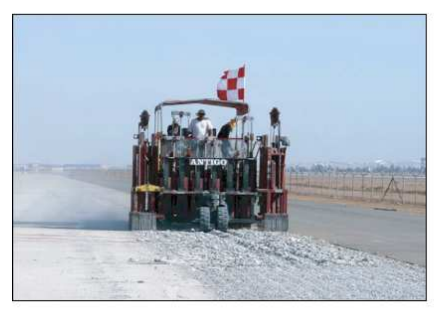
Phase 2 Rubblization using a MHB Badger Breaker®