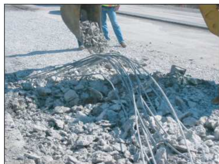
Continuously reinforced concrete pavement